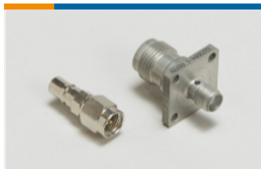
Between Series Adapters(1)