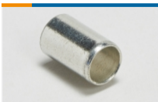
Rack & Panel Ferrules & Inserts(1)