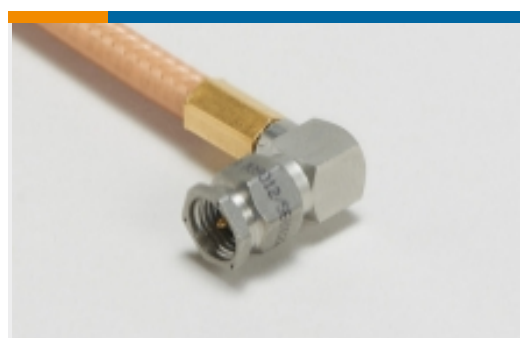
RF Cable Assemblies(2)